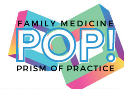
Exhibit space is guaranteed with all Supporter packages, including priority placement. Only a very limited number of exhibit-only spaces may be available.