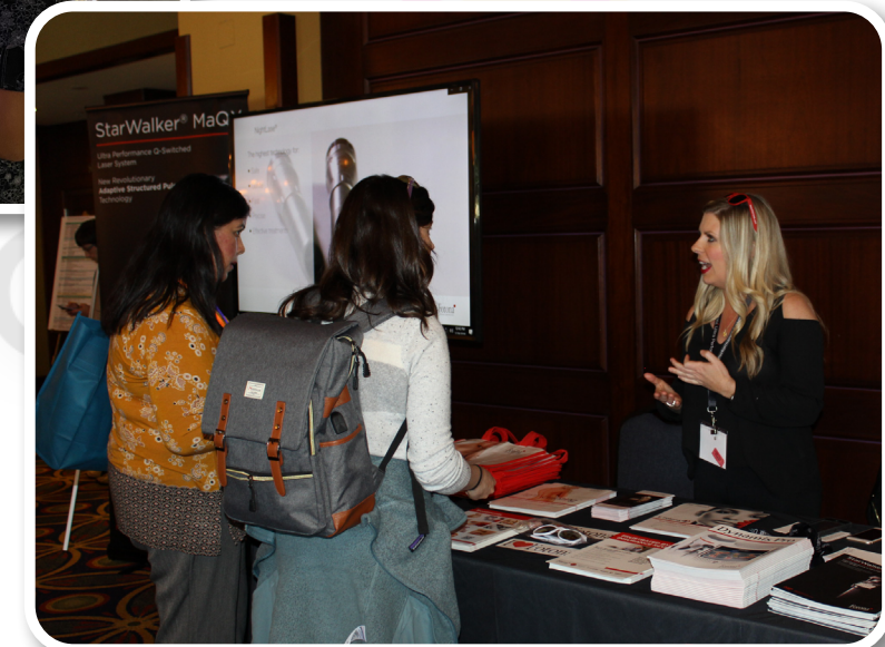
Exhibit Booth Package $2,800

Includes one 6'x3' table top exhibit booth, two chairs and trash can. Includes access to exhibitor space and meals for two individuals. Organization name and booth location highlighted within conference app. A separate fee applies when more than two people staff the booth at once. Confirmation packets will include prices for additional items, such as electricity and box handling.