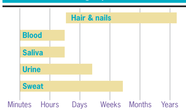
Figure 2. Relative detection times of drugs in various biologic specimens

Caplan YH, Goldberger BA. J Anal Toxicol. 2001;25:396-399.